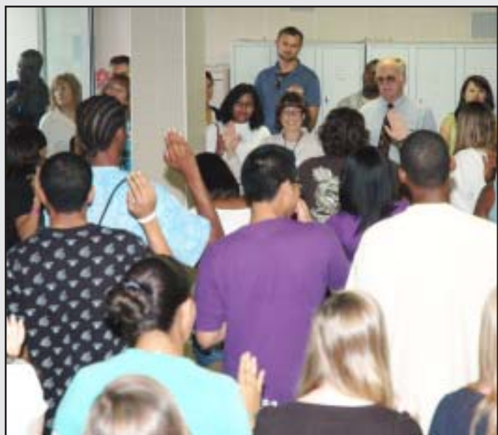
2008 summer hires raise their hand as they take the oath of Service on their first day of work.